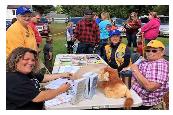
<u>Coleman Lions</u> KidSight screening at Sanford's Founder's Day. The Lions screened 63 children with 6 referrals.