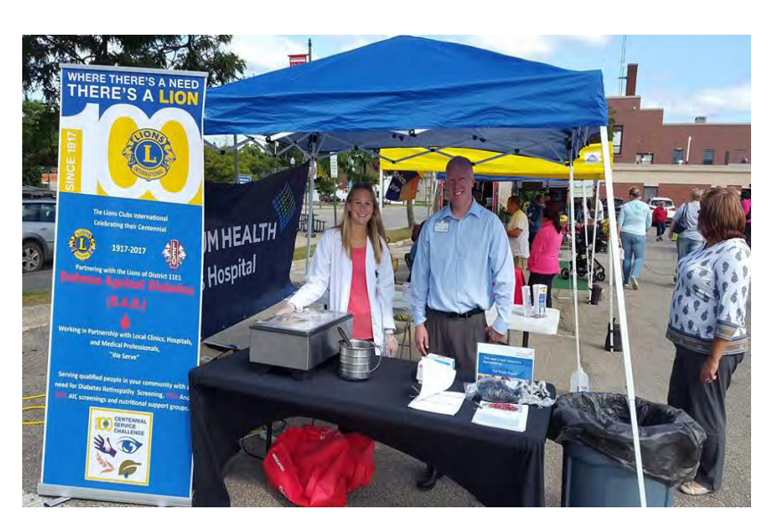
DAD Tent! Big Rapids Farmers Market