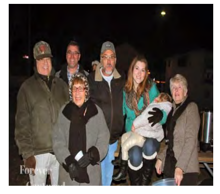
Howard City Lions Tree Lighting –The Lions provided hot chocolate and cookies at the Howard City Christmas tree lighting.