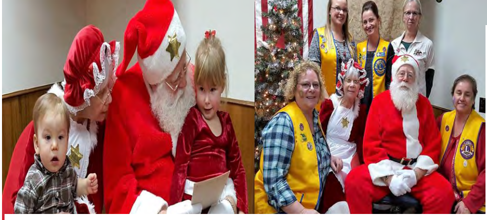
Cedar/Maple City Christmas Party