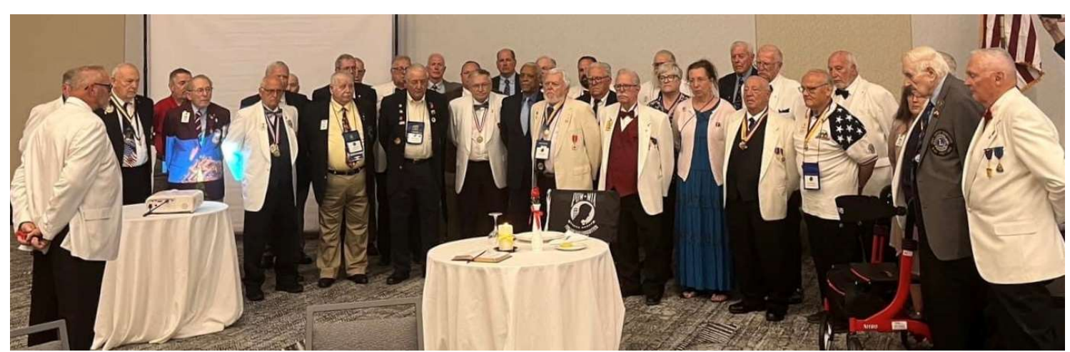
Veterans Memorial Service honoring those who gave their lives for us. POW/MIA table symbolically representing those veterans who cannot be present. Pictured are Lions who are also veterans.