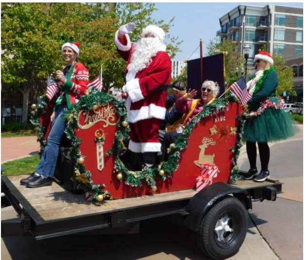
End of the parade!!