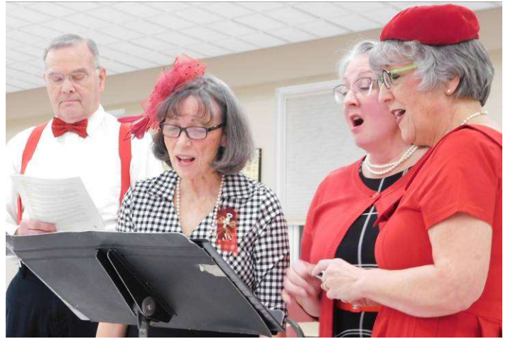
Golden Guild Players performs a Christmas radio show with commercials!