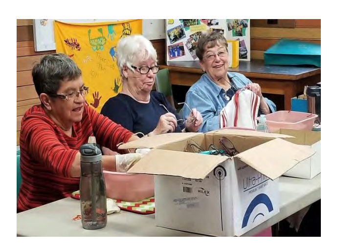
The District 11 E1 Eye Glass Mission trip to Mexico was so successful that work has begun to collect, clean and sort eye glasses for the next mission trip in 2020. The Lions above are having fun as they clean a new supply of glasses.

Picture left: Coleman Lions prepare their food trailer to serve meals at the Sanford Lake Fishing Tournament May 18.