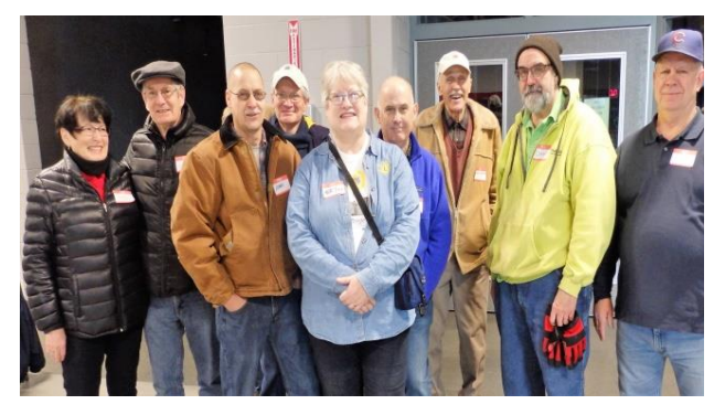
The Midland Lions sponsored and worked the Midland Food Distribution in January at the Midland Ice Arena. Two hundred twenty five families received food.

Work Sessions: Feb. 3 – Kaleva, Feb12 – Harrison, Feb. 19 – Coleman. All Lions are welcome!