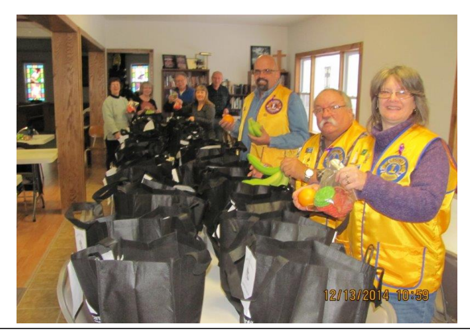
Chippewa Lakes-Mecosta Lions packed Merry Christmas bags for 40 families in the area