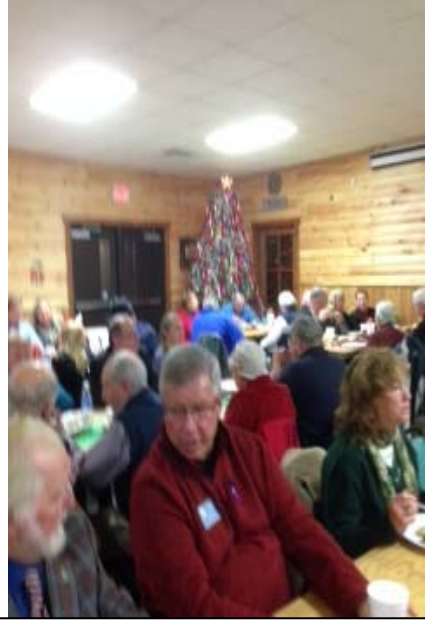
Seventy Five Lions attended a Zone Christmas Party hosted by the Kaleva Lions Club – Bear Lake, Manistee, Mesick and Onekama Lions shared friendship, a wonderful buffet dinner, and music to dance to.