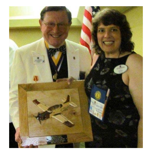
PIP Sid Scruggs Gift (The plane not the 1<sup>st</sup> Lady) (Made by PDG Dan Gibbons)