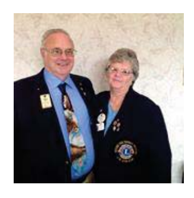
Region 1, Zone 2

The first of November the clubs of our Zone held a dinner dance.