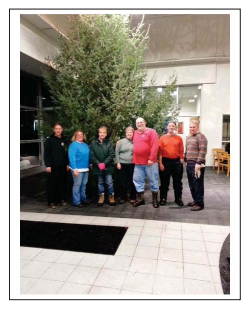
NS CLUB WAST & MICHIGAN BOO

and installed a 20 foot tree for Fox Motors in Traverse City. The snow was deep and the wind chill 10 degrees but the Lions Served. The club will be selling trees for three more weekends.