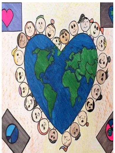
HARRISON LIONS CLUB FARWELL SCHOOLS