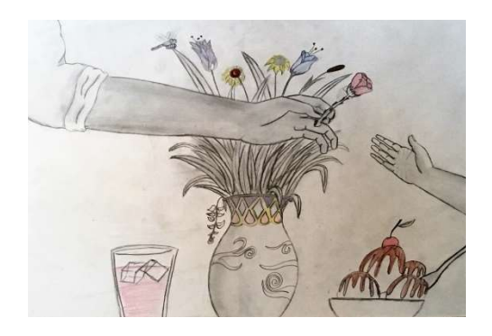
SANFORD MERIDIAN MIDDLE SCHOOL