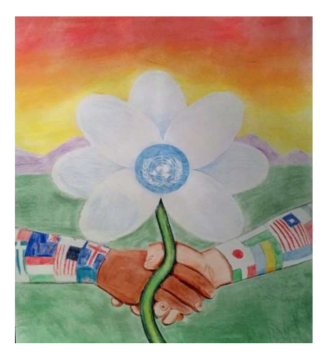
DISTRICT 11 E1 PEACE POSTER WINNER – COLEMAN SCHOOL