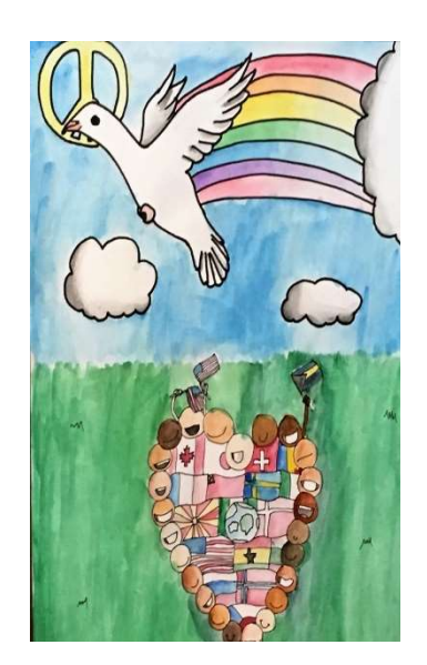
ST. MARY LEELANAU SCHOOL