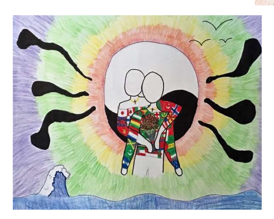
CENTRAL MONTCALM MIDDLE SCHOOL