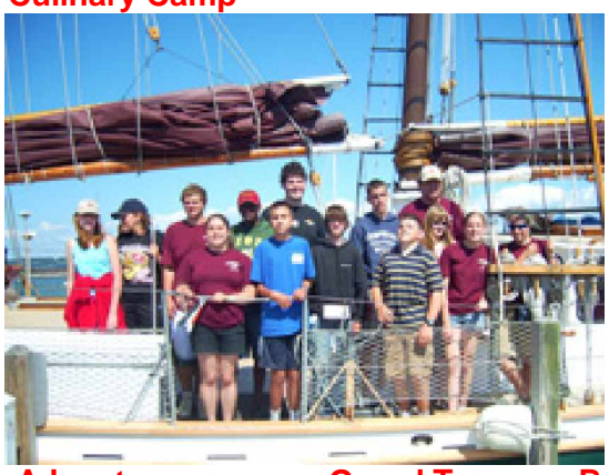
Adventure camp on Grand Traverse Bay

Camp Tuhsmeheta's summer has been both action packed and relaxing. From Elementary camp to Music camp the experiences that these young blind and visually impaired campers have had will stay with them the rest of their lives. Starting with flying airplanes to shooting bow and arrow, nothing was held back from their experience. The campers met old friends that they only see once a year at the camp. New friendships began and old ones rekindled.