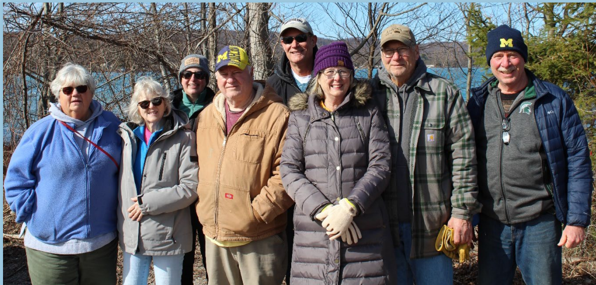
Members of the Empire club conducted a Spring Adopt a Highway cleanup on April 5 th .