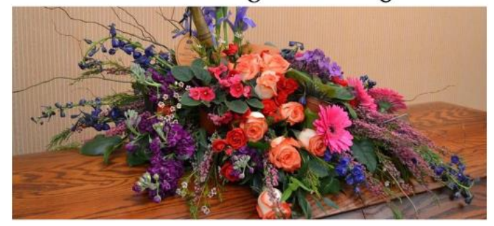
Lions District 11-E1 Memorial 2020