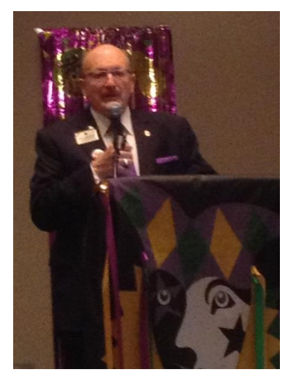
Just a few pictures from the District convention. Sure hope that everyone had a good time!!!!!!!