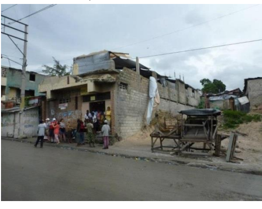
Church where the vision clinic worked out of.